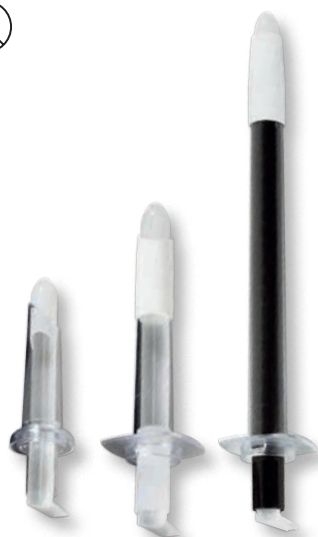
85x20 mm 130x20 mm 250x20 mm